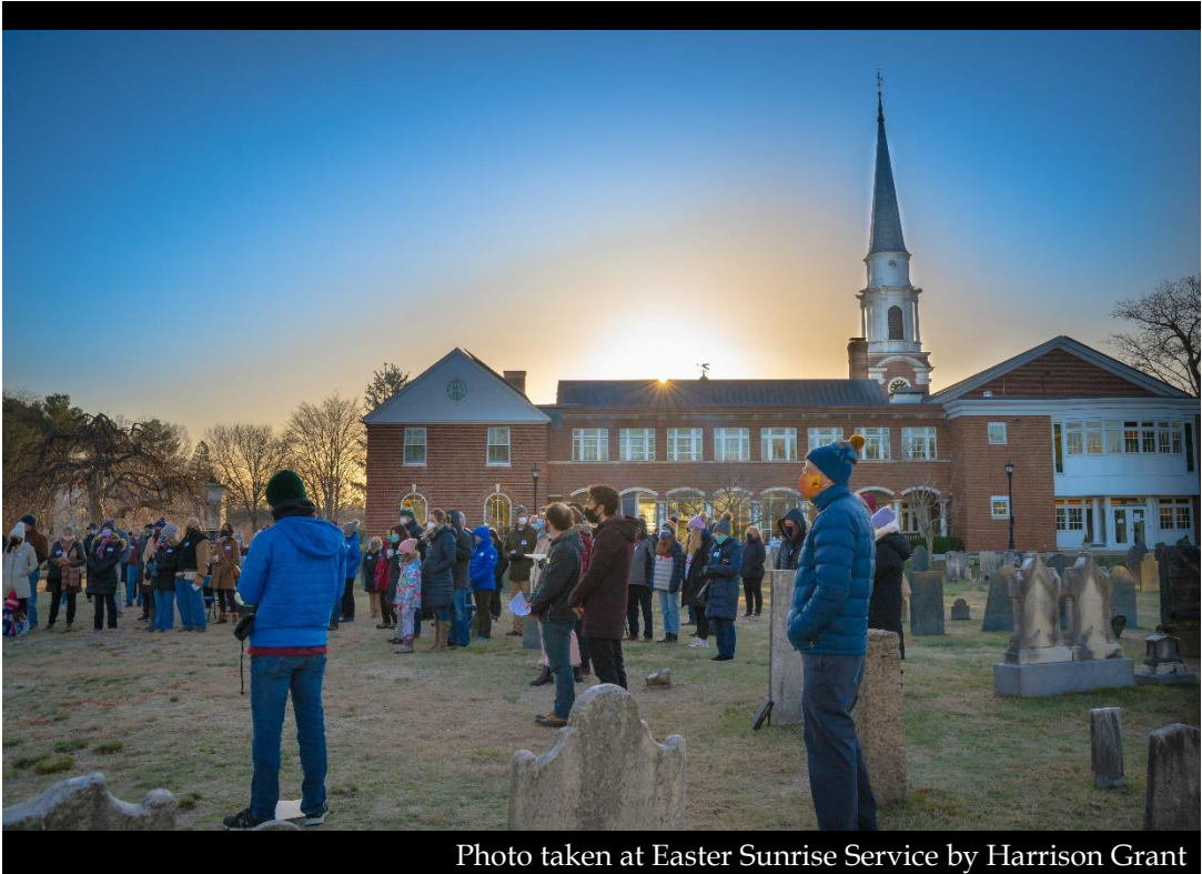
Photo taken at Easter Sunrise Service

Congregational † United Church of Christ